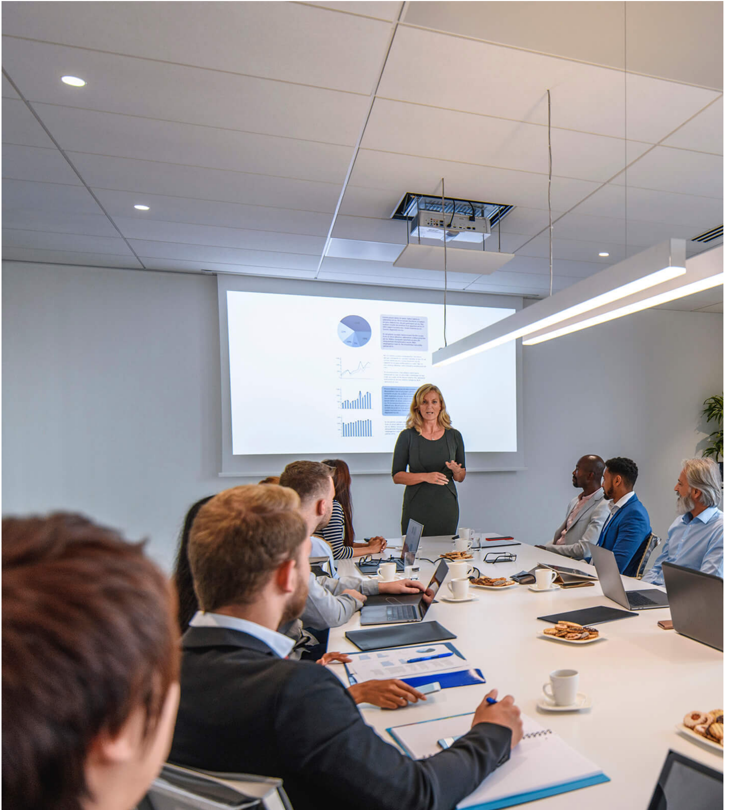
Meeting Room / Office