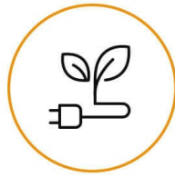
Low Power Consumption