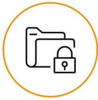
TLS 1.3/FIPS 140-3 Encryption