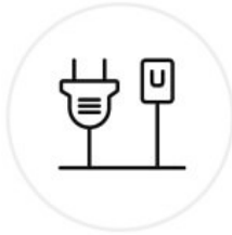
Network / Power Redundancy