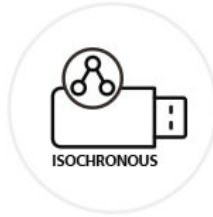
Isochronous USB Transfer