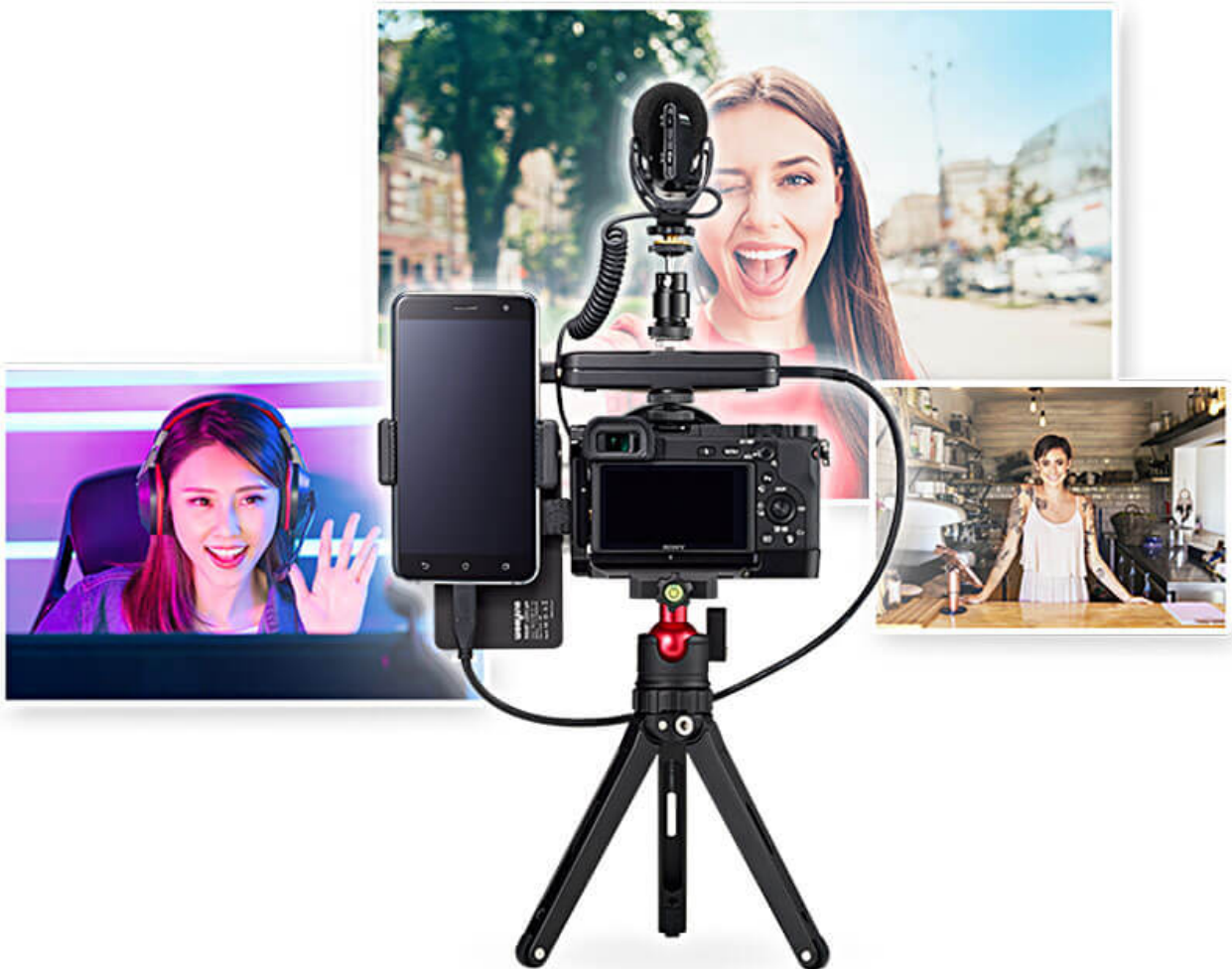
Multiple Applications, both Indoor and Outdoor