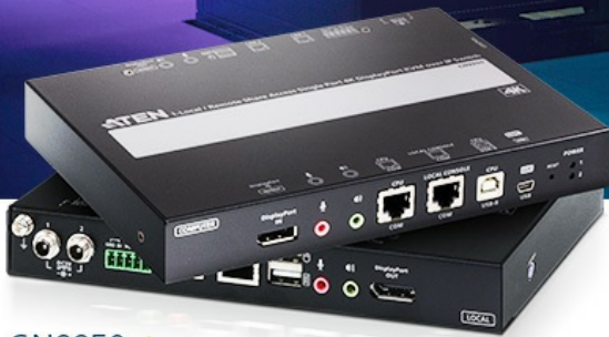
CN9950 ▲ 1-Local/Remote Share Access Single Port 4K DisplayPort KVM over IP Switch