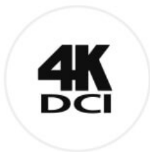
Superior Visual Quality