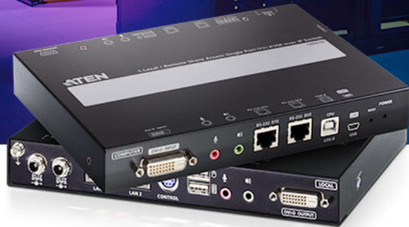
CN9600 ▲ 1-Local/Remote Share Access Single Port DVI KVM over IP Switch