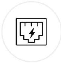
10 Gbps Network