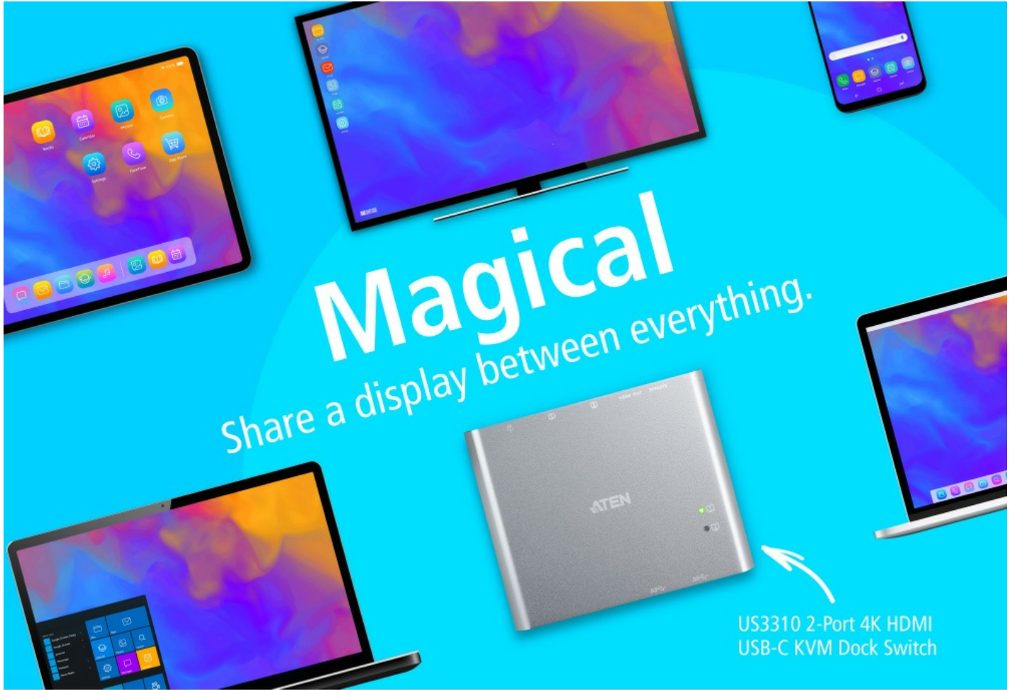
US3310 2-Port 4K HDMI USB-C KVM Dock Switch