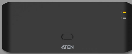
2 x 4 USB 2.0 Sharing Switch