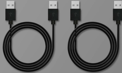
USB Type-A to Type-A cable x2 (1.5 m)