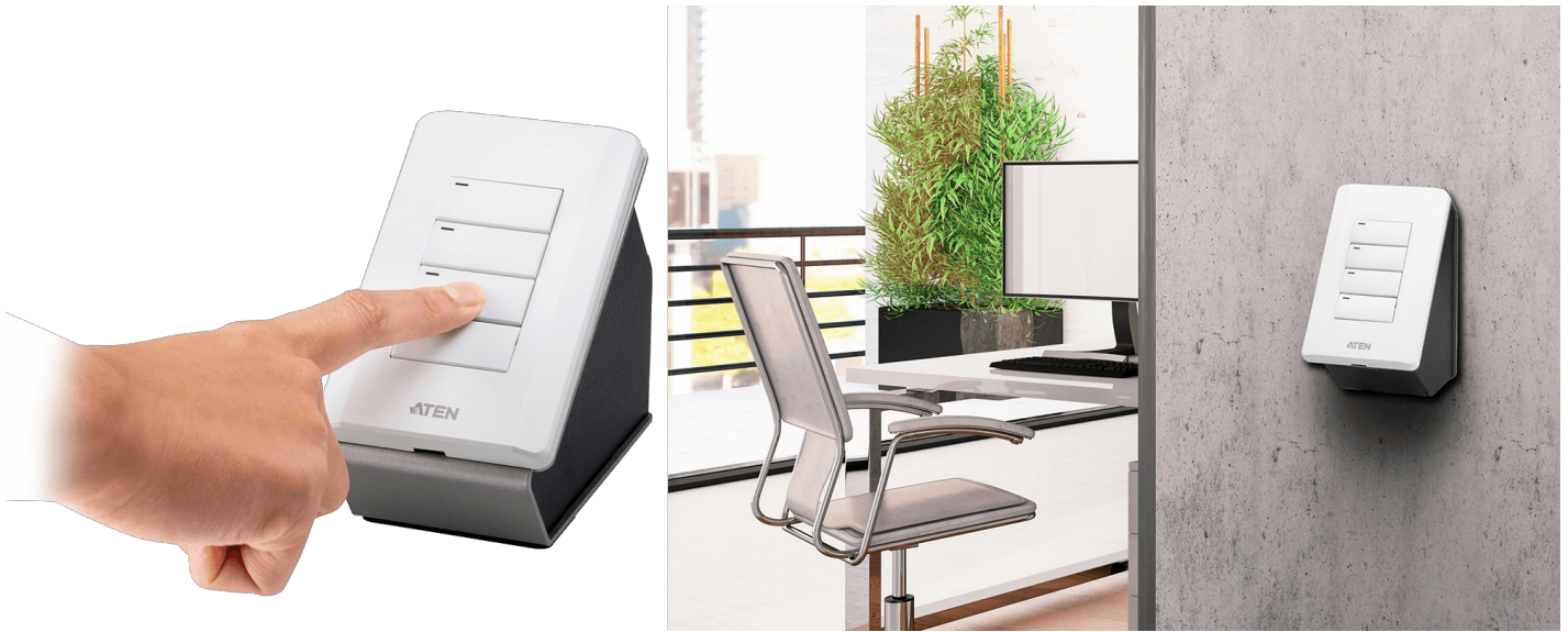
Enables flexible installation for either placement on the table or mounting on the wall