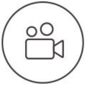
Dual Video Capture