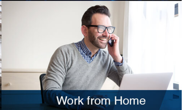
Work from Home